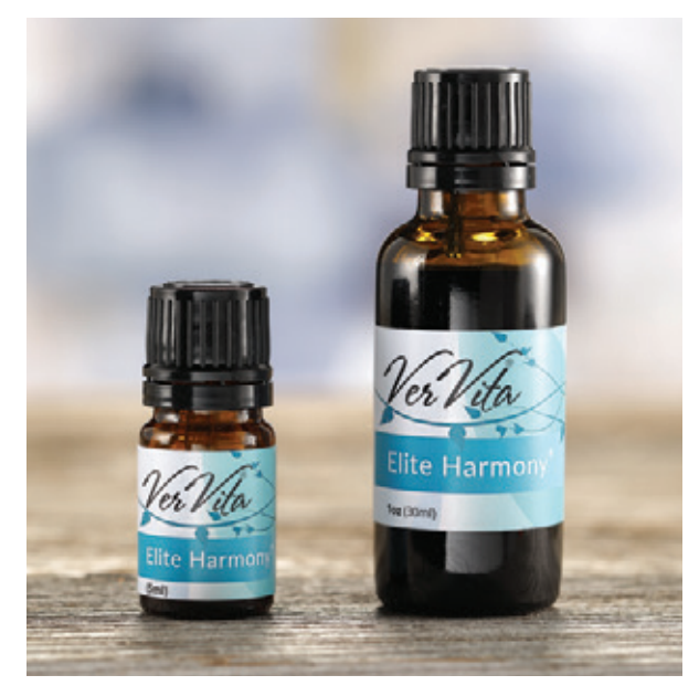
Elite Harmony Available In 1 oz | 5 ml Bottles

A healthy body is able to maintain health and balance despite emotional and physical attacks. But when the body can no longer resist viral, bacterial, mold, yeast, fungal, and parasite attacks, it becomes vulnerable to autoimmune syndromes. If attacks continue, a domino effect is created as the brain, heart, digestive and other systems of the body work overtime to compensate and support