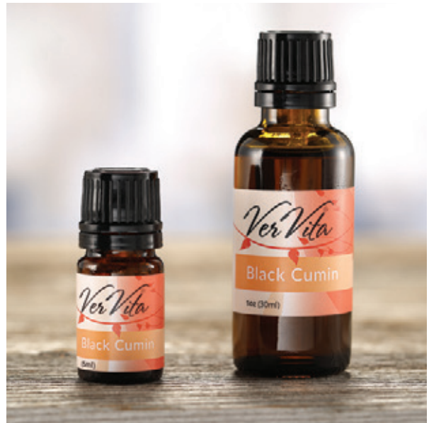
Black Cumin Available In 1 oz | 5 ml Bottles

Black Cumin has many components. It is high in thymoquinone , a natural and very potent antioxidant. Studies have shown thymoquinone to be beneficial as an anti-inflammatory and analgesic (pain relief). It has a bronchodilating effect and inhibits the secretion of histamines, which is beneficial to those with allergies. It aids bile production in the liver and assists in fat metabolism and detoxification. Black Cumin is also high in essential fatty acids such as omega 3 and omega 6 , which are known for their effects on brain function, nerve conduction, blood pressure, and the immune system's defenses. Black Cumin is rich in vitamin B complex (riboflavin, thiamine, niacin) and contains selenium , beta-carotene , arginine , amino acids , calcium , iron , sodium , and potassium . All of these are found in Black Cumin, a balanced whole food, just as nature created it.